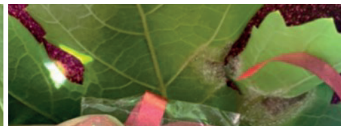
MIMOTEN® (3 days after application)

MIMOTEN® controls the advance of the fungal infection of downy mildew on vines, drying it out in 48-72 hours.