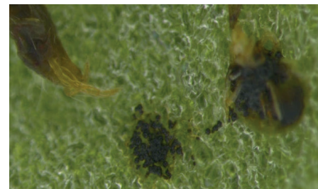
CANELYS® (t = + 24 h)

CANELYS® greatly reduces the spread of the powdery mildew fungus (left panels). In addition, it is able to control both adults and spider mite eggs by contact in less than 24 hours (right-hand panel).