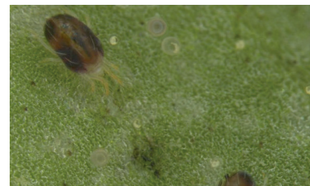
CONTROL (t = 0 h)